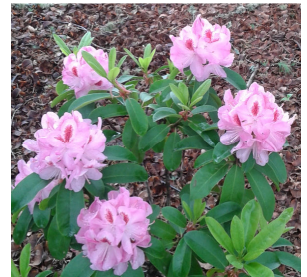
Counterclockwise from left: Some of our lovely Lane County rhododendrons include Cynthia, Blue Peter, Lem's Monarch, Pink Walloper, Virginia Richards, Scintillation and Catawbiense Boursalt.