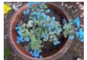
Some flowers just don't quit! Pix taken 4.4.18. Clockwise: primrose , daffodils , Akebono flowering cherry , Euphorbia , Hellebores , Brunnera